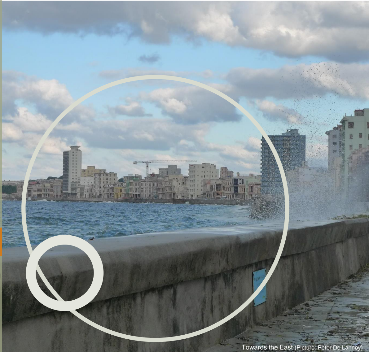
Towards the East

Cuba is one of the key partner countries of VLIR-UOS. From 2003 to 2021 VLIR-UOS spent over € 26,1 millions in cooperation with Cuba, including a long-term Institutional University Cooperation (IUC) Programme with Universidad Central “Marta Abreu” de las Villas (UCLV). The ongoing IUC programme with the Universidad de Oriente (UO) and the Network programme led by UCLV are the cornerstones of the VLIR-UOS cooperation with Cuba, next to 20 projects that have started since 2017.