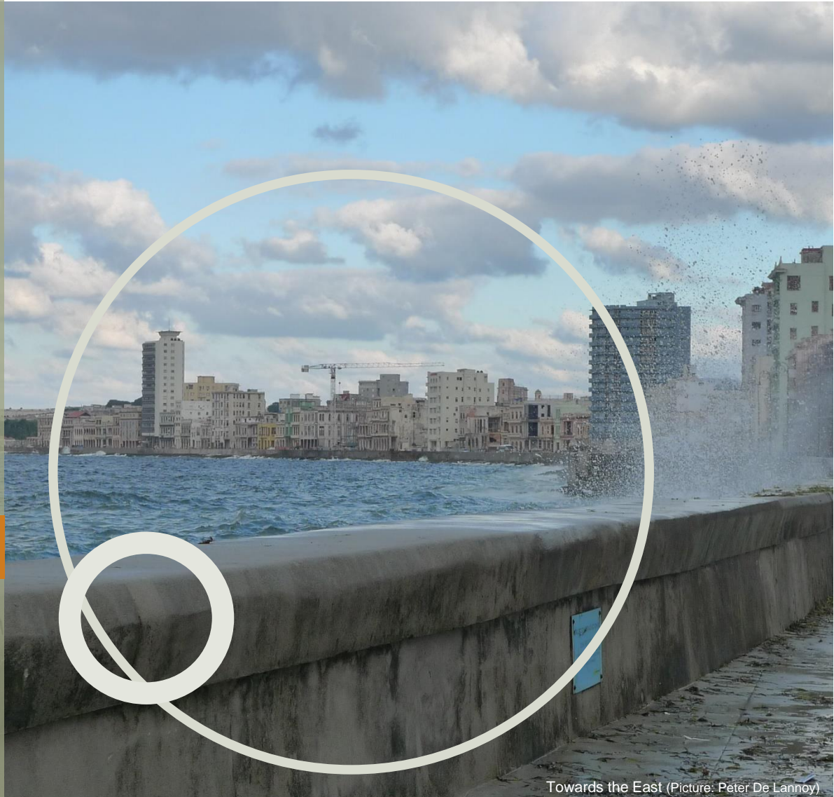
Towards the East

Cuba is one of the key partner countries of VLIR-UOS. From 2003 to 2023 VLIR-UOS spent nearly € 28 millions in cooperation with Cuba, including long-term Institutional University Cooperation (IUC) Programmes with Universidad Central “Marta Abreu” de las Villas (UCLV) and Universidad de Oriente (UO), and an ICT Network programme led by UCLV. Overall 95 projects were executed between 2003 and 2023.